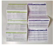
NEW Accordion 2-sided PocketCards